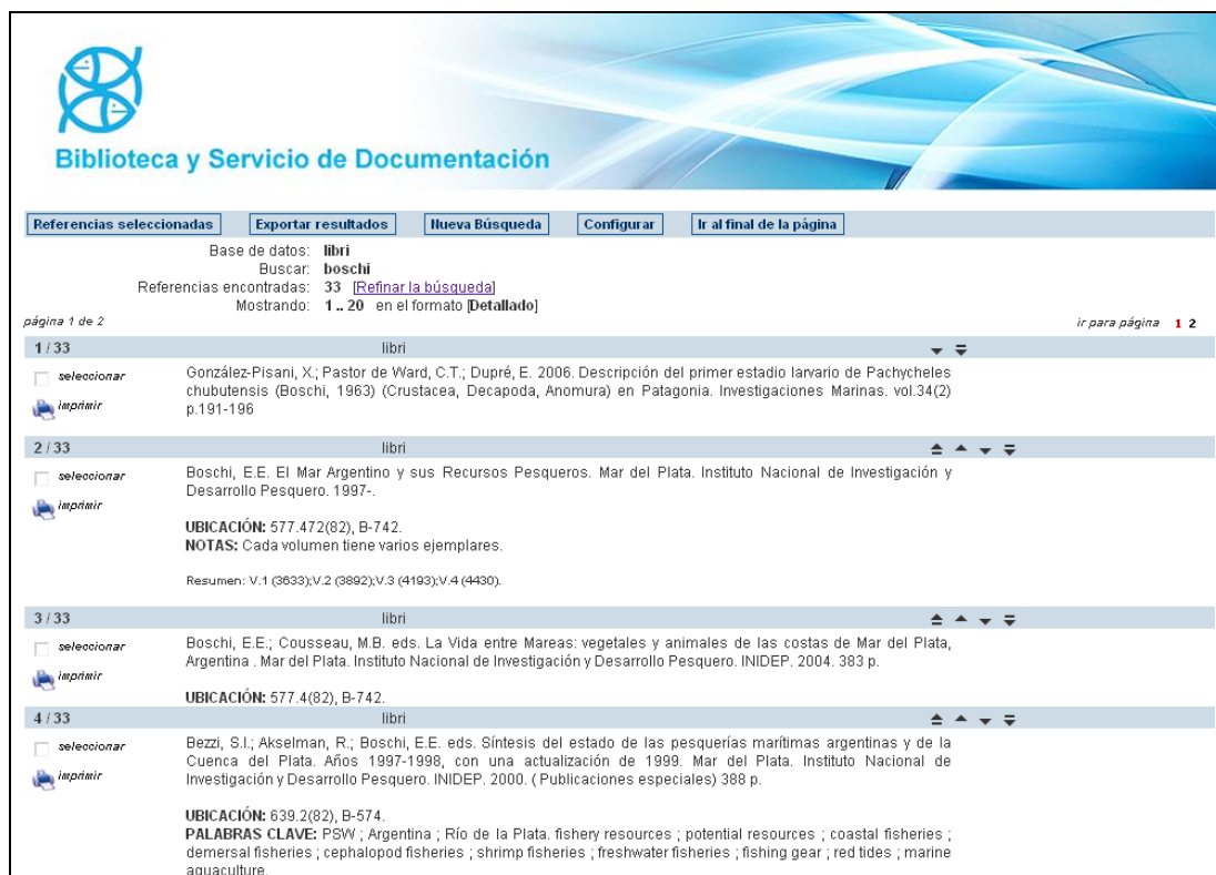
Figure 1. ABCD online catalog of INIDEP Library